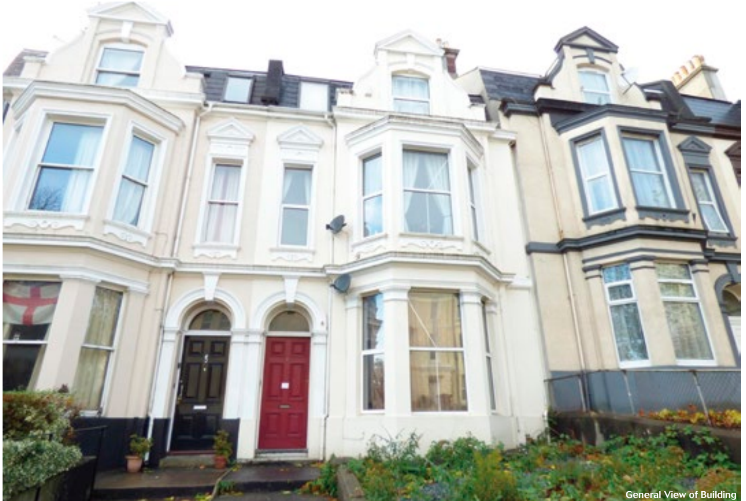
General View of Building

A vacant two bedroom ground floor flat situated in a popular residential lettings area in proximity of the city centre.