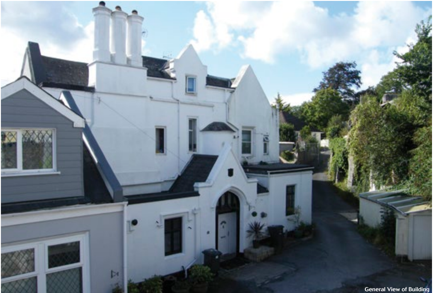
General View of Building

A spacious two bedroom apartment with garage, garden and parking, retaining a wealth of period features and having had the benefit of recent refurbishment.